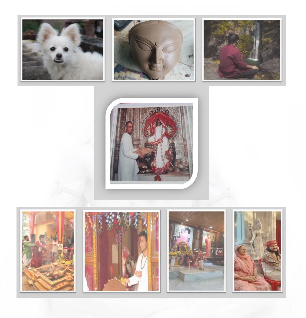
Page | 6